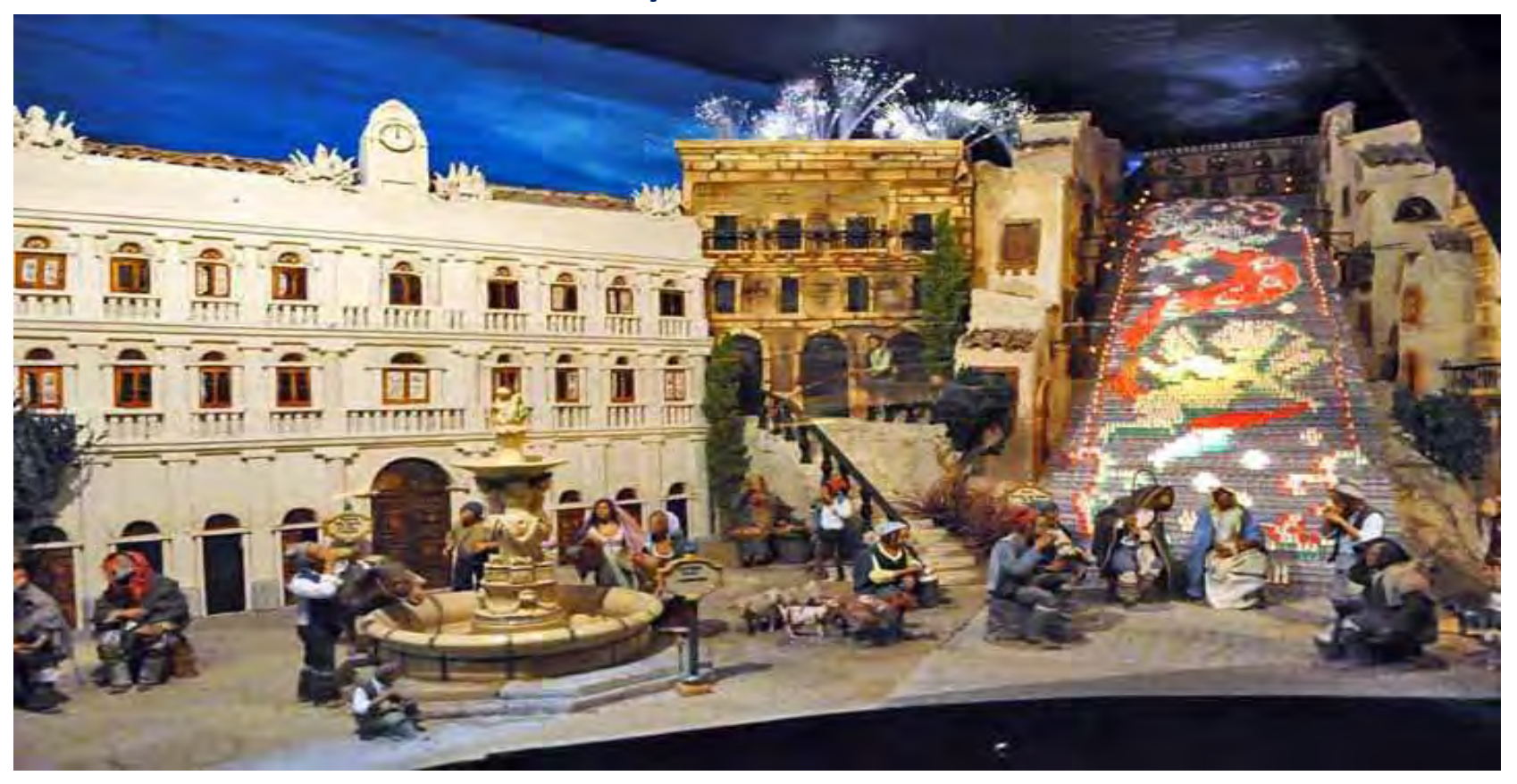
Day 4 : CALTAGIRONE

After breakfast departure to Caltagirone, the city of a thousand faces and famous for its wonderful ceramics. Visit of the centre, the Regional Ceramics Museum and the nativity scenes coming from the 5 Continents. Visit to a bakery to see how the typical Christmas cake is made. Free time at disposal. Return to Hotel. Dinner and overnight.