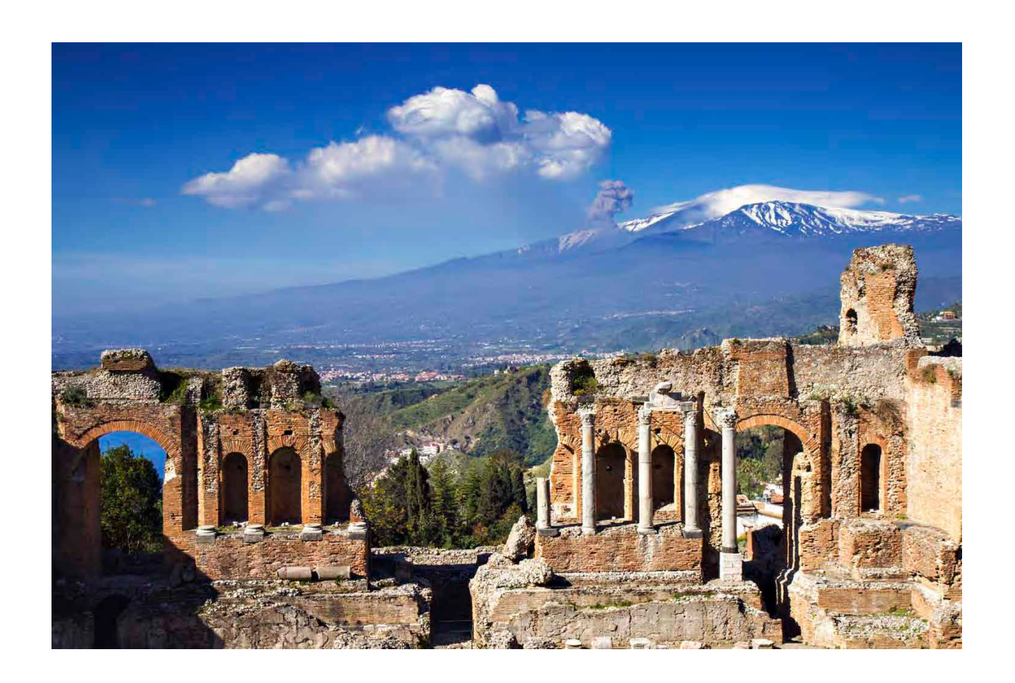
Day 5: ETNA VALLEY & METROPOLITAN THEATRE OF CATANIA

Breakfast in Hotel and departure for tour of the Etna Valley . Visit of a wine cellar. Return to Hotel. In the evening Italian Lyrics song at Metropolitan theatre in Catania. Overnight stay.